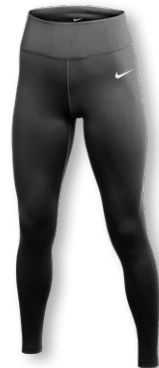
NIKE TEAM ONE MID RISE TIGHT DR5352 Page 44