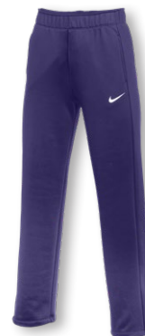
NIKE THERMA ALL TIME PANT CN9394 Page 12