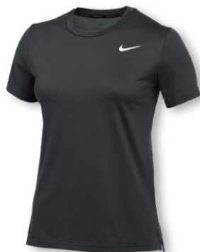
NIKE TEAM HYPER DF SHORT SLEEVE TOP CU9616 Page 19