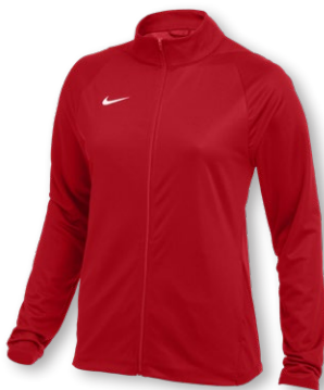
NIKE EPIC KNIT JACKET 2.0 CN9520 Page 13