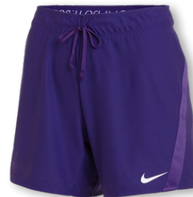
NIKE DRI-FIT ATTACK SHORT CJ1786 Page 48