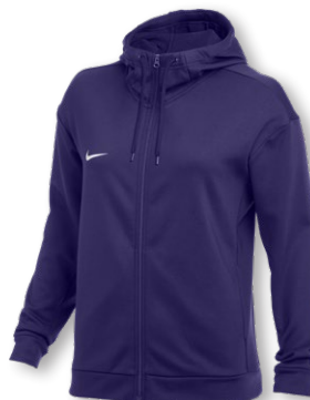
NIKE THERMA ALL TIME FZ RIB DRAWCORD CN9340 Page 12