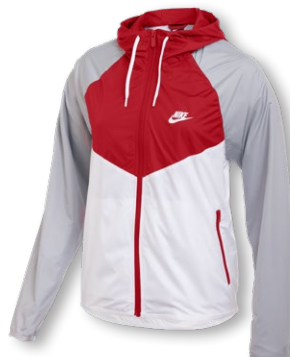
NIKE TEAM WINDRUNNER JACKET CU9550 Page 33