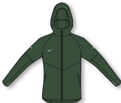
NIKE TEAM MILER REPEL JACKET DH8117 Page 11