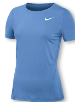
NIKE PRO ALLOVER MESH SS TOP 2.0 DH4905 Page 36