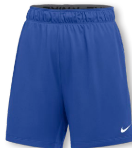
NIKE TEAM DF ATTACK SHORT FJ9860 Page 47