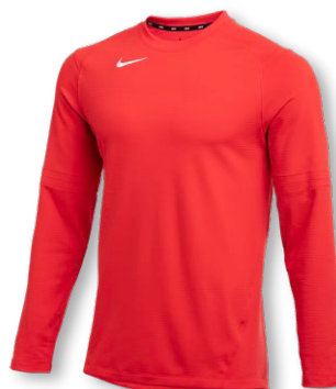
NIKE DRI-FIT PRE-GAME LS TOP DC9106 Page 20