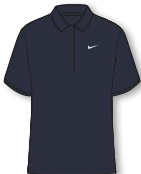
NIKE TEAM DF VICTORY SS POLO DJ8522 Page 29