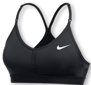
NIKE TEAM INDY V-NECK BRA DJ8523 Page 35