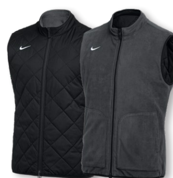
NIKE TEAM REVERSIBLE VEST DR5296 Page 34