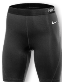
NIKE PRO 8IN SHORT DX9131 Page 40