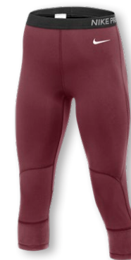
NIKE PRO HYPERCOOL 3QT TIGHT DX9129 Page 39