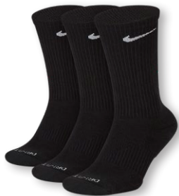
NIKE EVERYDAY PLUS CUSHION CREW 3PPK SX6888 Page 51