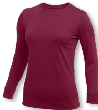
NIKE WMNS CORE LS COTTON CREW CJ1722 Page 28