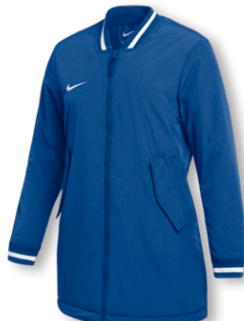
NIKE STOCK DUGOUT JACKET DC9103 Page 32