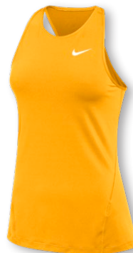
NIKE PRO ALLOVER MESH TANK DH4901 Page 36