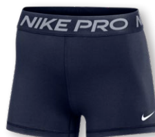
NIKE PRO 365 SHORT 3IN DH4863 Page 40