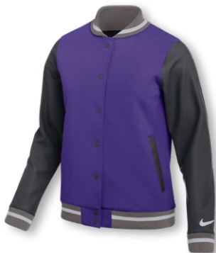
NIKE STOCK LETTERMAN JACKET DJ5972 Page 31