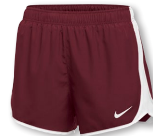
NIKE DRI-FIT TEMPO SHORT 849585 Page 48