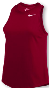
NIKE DRI-FIT HIGH NECK TANK CJ1711 Page 23