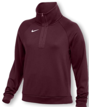
NIKE THERMA ALL TIME MOCK HALF ZIP CN9390 Page 14