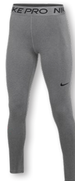
NIKE PRO 365 TIGHT DH4893 Page 38