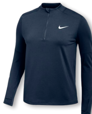
NIKE DRI-FIT ELEMENT 1/2-ZIP TOP DH4951 Page 24