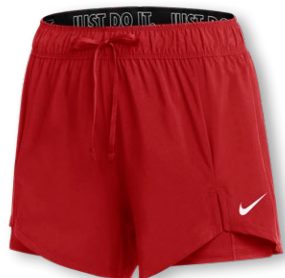
NIKE TEAM DRI-FIT FLEX 2-1 SHORT DJ8680 Page 46