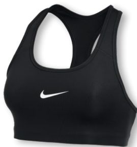
NIKE SWOOSH BRA 2.0 CJ5949 Page 35