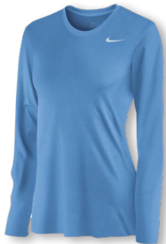
NIKE WMNS LEGEND LS TEE DV7311 Page 26