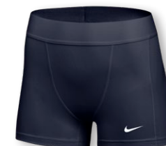
NEW NIKE PRO LEAKPROOF PERIOD PROTECTION 3IN SHORT FQ3007 Page 41