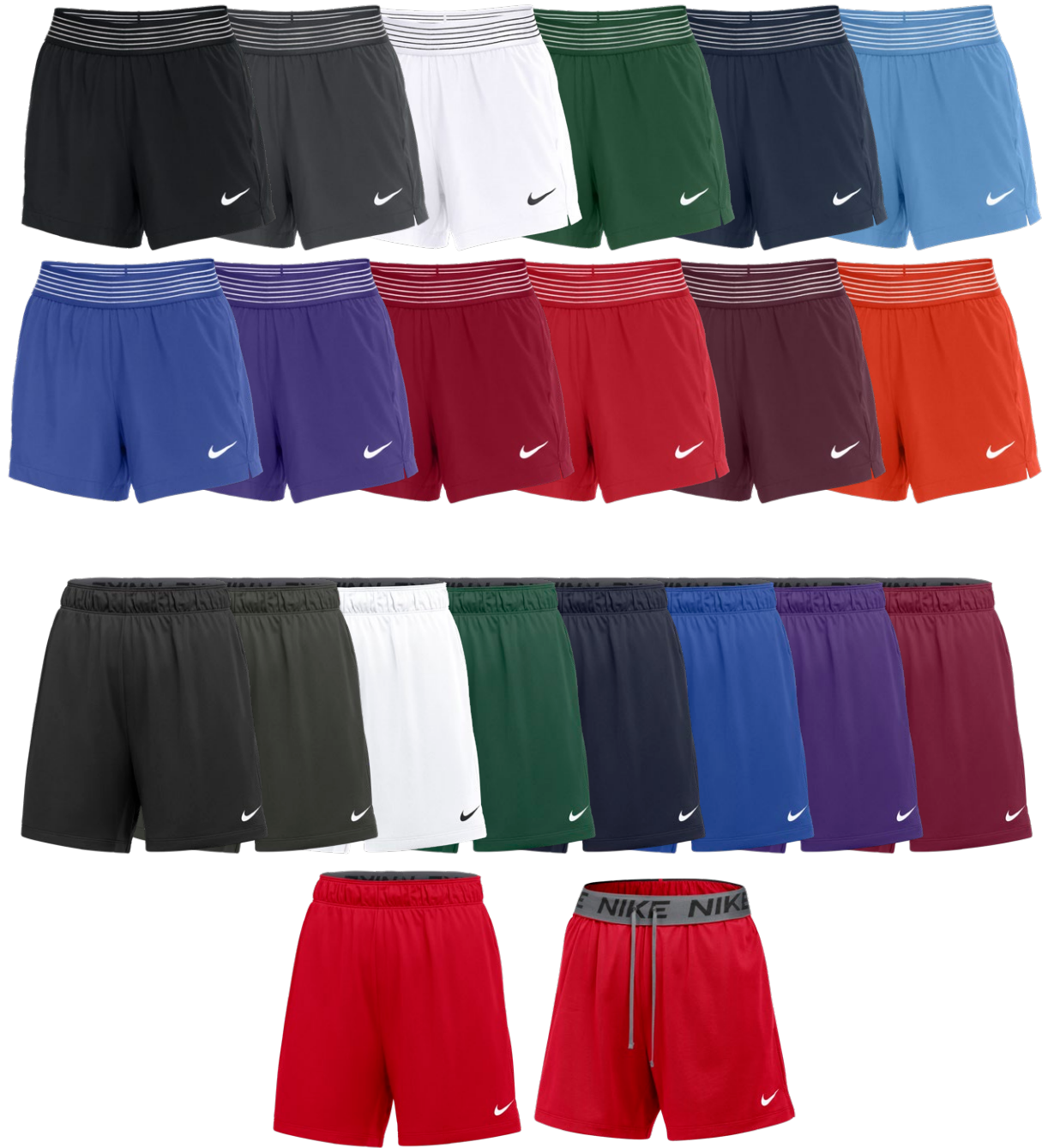
VIEW WITH WAISTBAND DOWN