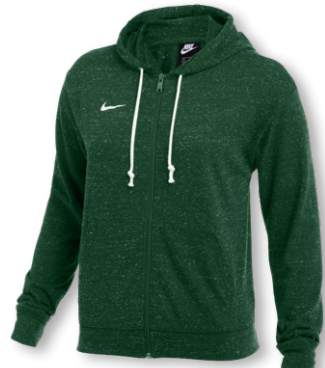
NIKE SPORTSWEAR GYM VINTAGE FZ HOODIE CN9402 Page 15