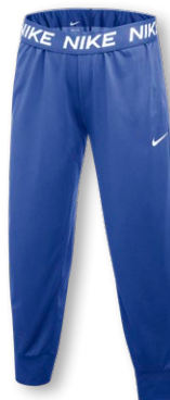
NIKE TEAM ATTACK 7/8 PANT DV6735 Page 45