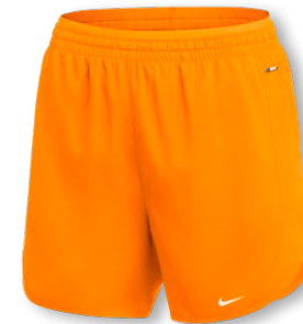
NIKE TEAM TEMPO LUXE 5IN SHORT DJ8528 Page 46