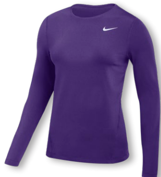
NIKE PRO ALLOVER MESH LS TOP 2.0 DH4902 Page 37