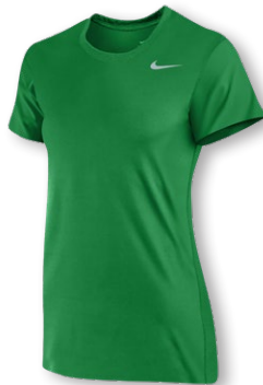
NIKE WMNS LEGEND SS TEE DV7312 Page 27