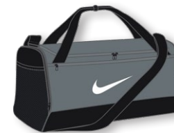
NIKE BRASILIA SMALL DUFFEL 9.5 DM3976 Page 49