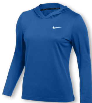
NIKE TEAM HYPER DF LONG SLEEVE TOP CU9619 Page 19