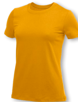
NIKE WMNS CORE SS COTTON CREW CJ1769 Page 28