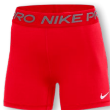
NIKE PRO 365 SHORT 5IN DH4886 Page 40