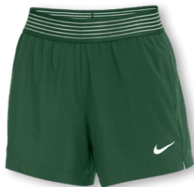
NIKE FLEX 4IN SHORT CW7268 Page 47