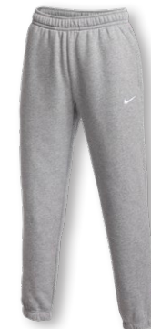
NIKE TEAM CLUB PANT CJ1790 Page 18