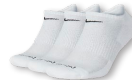
NIKE EVERYDAY PLUS CUSHION NO SHOW 3PPK SX6889 Page 51