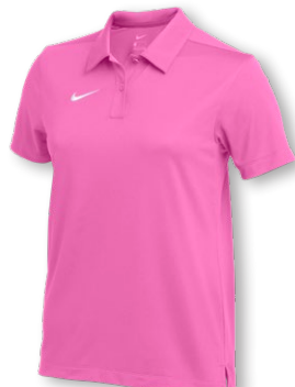
NIKE DF FRANCHISE POLO CU3206 Page 30