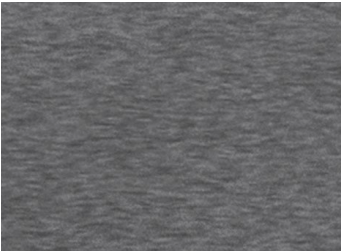
FABRIC DETAIL FOR CARBON HEATHER