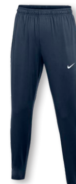
NIKE DRI-FIT ELEMENT PANT DH5183 Page 25