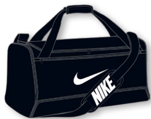
NIKE BRASILIA LARGE DUFFEL 9.5 D09193 Page 49