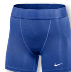
NEW NIKE PRO LEAKPROOF PERIOD PROTECTION TEAM 5IN SHORT FQ3012 Page 41