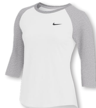
NIKE DRI-FIT 3/4 SLEEVE RAGLAN TOP CJ1703 Page 20