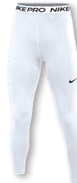
NIKE PRO 365 7/8-LENGTH TIGHT DH4896 Page 38