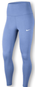
NIKE TEAM YOGA 7/8 TIGHT DJ8524 Page 43