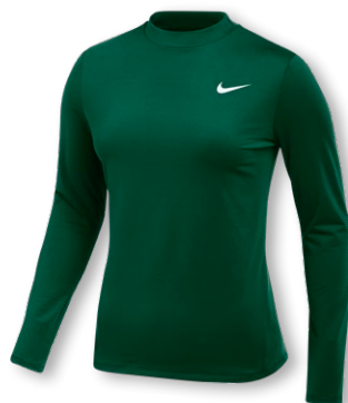
NIKE PRO INTERTWIST TOP 2.0 DH4897 Page 37