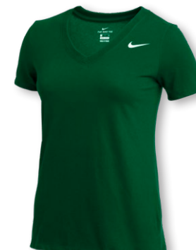
NIKE DRI-FIT SHORT SLEEVE V-NECK CJ1714 Page 21