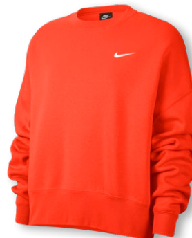
NIKE TEAM FLEECE TREND CREW DJ8525 Page 16