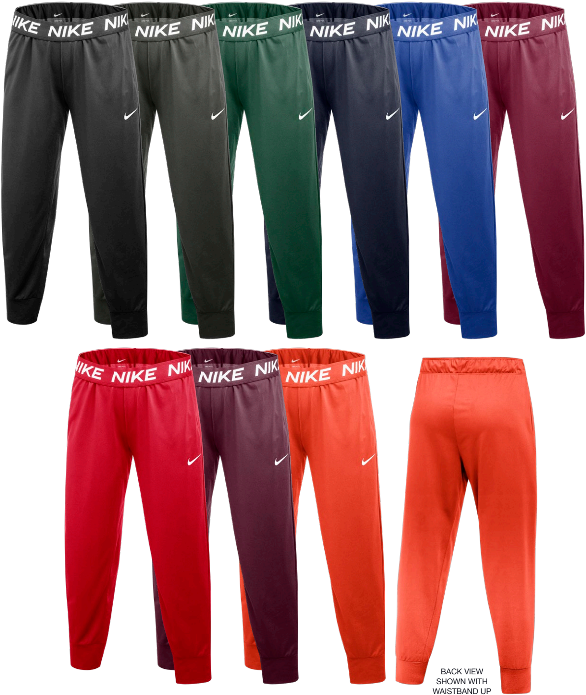
BACK VIEW SHOWN WITH WAISTBAND UP