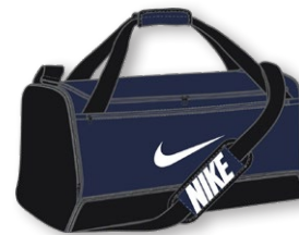
NIKE BRASILIA MEDIUM DUFFEL 9.5 DH7710 Page 49