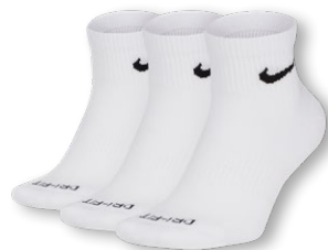
NIKE EVERYDAY PLUS CUSHION ANKLE 3PPK SX6890 Page 51