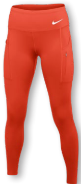
NIKE GO TF MID-RISE 7/8-TIGHT FJ9869 Page 42