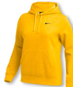
NIKE TEAM CLUB PULLOVER HOODIE CJ1789 Page 17