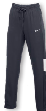
NIKE DRI-FIT PANT CJ1805 Page 10