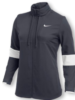
NIKE DRI-FIT JACKET CJ1796 Page 10