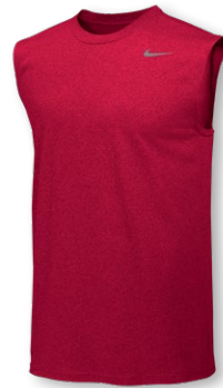
NIKE TEAM LEGEND SL CREW DV7307 Page 24