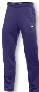
NIKE THERMA PANT REGULAR CN9483 Page 12