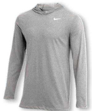
NIKE DF LONG SLEEVE HOODIE TEE CJ1696 Page 21