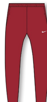
NIKE TEAM MILER REPEL PANT DH8110 Page 11