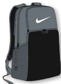
NIKE BRASILIA BACKPACK XL 9.5 DM3975 Page 44