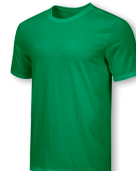
NIKE CORE SS COTTON CREW CJ1693 Page 25