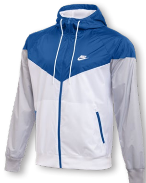
NIKE TEAM WINDRUNNER JACKET HD CU9474 Page 32