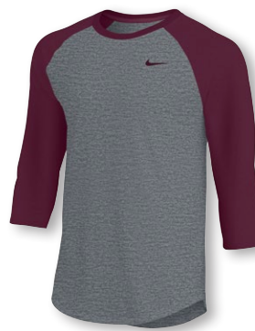
NIKE DF 3/4 SLEEVE RAGLAN TOP CJ1617 Page 22