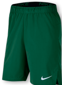
NIKE TEAM DF FLEX WOVEN SHORT NO POCKETS DJ8693 Page 42