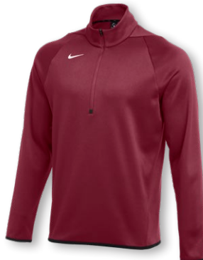
NIKE THERMA LS 1/4-ZIP TOP CN9492 Page 15