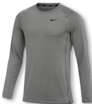
NIKE PRO SLIM LS TRAINING TOP DH4788 Page 33