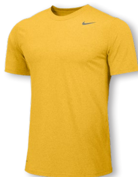
NIKE TEAM LEGEND SS CREW DV7299 Page 24