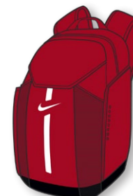
NIKE ACADEMY TEAM BACKPACK DC2647 Page 45