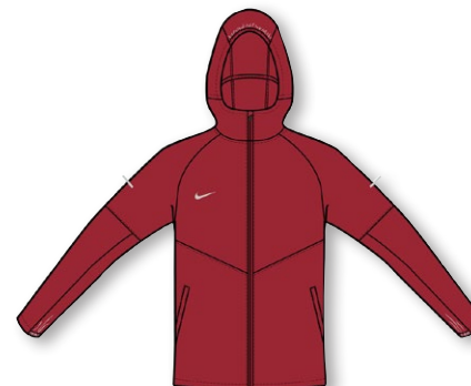
NIKE TEAM MILER REPEL JACKET DH8109 Page 11