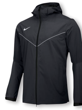
NIKE WATERPROOF JACKET DA4967 Page 30