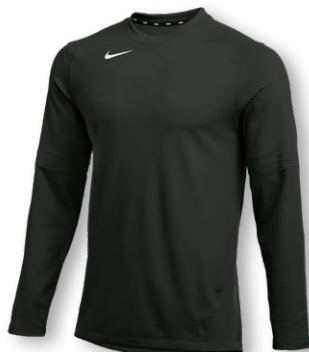
NIKE STOCK LS CREW PRE-GAME TOP CT4050 Page 22