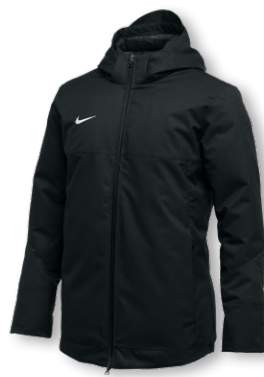
NIKE TEAM DOWN FILL PARKA DJ6526 Page 29