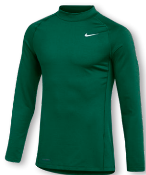
NIKE PRO MOCK-NECK LS TRAINING TOP DH4806 Page 33