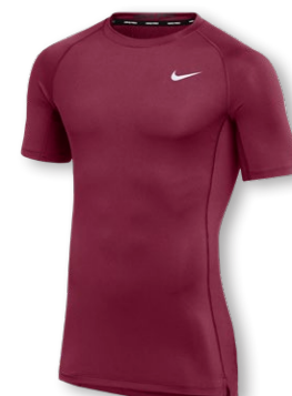
NIKE PRO TIGHT SS TRAINING TOP DH4800 Page 35