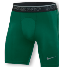
NIKE PRO TRAINING COMPRESSION SHORT DH4762 Page 38