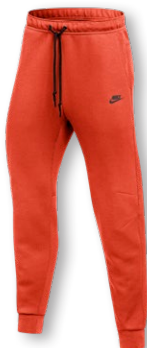
NEW NIKE TECH FLEECE JOGGER FQ1884 Page 9