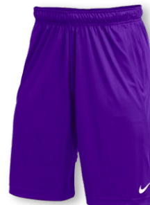
NIKE TEAM KNIT SHORT CU3460 Page 43