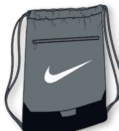
NIKE BRASILIA DRAWSTRING 9.5 DM3978 Page 45