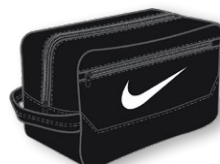
NIKE BRASILIA SHOE BAG 9.5 DM3982 Page 45