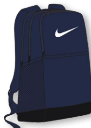
NIKE BRASILIA MEDIUM BACKPACK 9.5 DH7709 Page 44