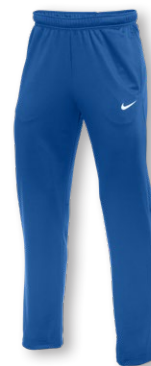
NIKE EPIC KNIT PANT 2.0 CN9470 Page 13