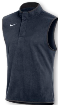
NIKE THERMA VEST DA4965 Page 31