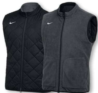
NIKE TEAM REVERSIBLE VEST CW8038 Page 31