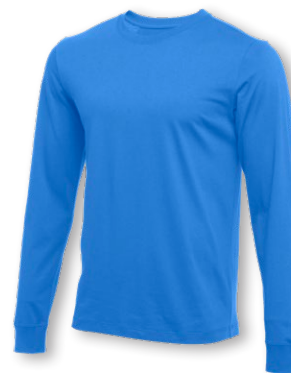
NIKE CORE LS COTTON CREW CJ1690 Page 25