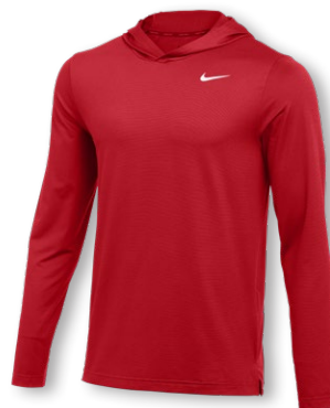
NIKE TEAM HYPER DF LONG SLEEVE TOP CU9458 Page 20