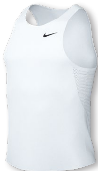
NIKE PRO DRI-FIT COMPRESSION TANK DZ4690 Page 36