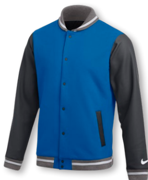
NIKE STOCK LETTERMAN JACKET DJ5971 Page 28