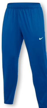
NIKE DRI-FIT ELEMENT PANT DH4950 Page 19