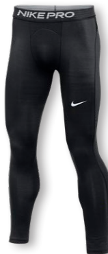
NIKE PRO WARM TRAINING TIGHT DH4802 Page 37