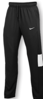
NIKE DRI-FIT PANT CV0096 Page 10