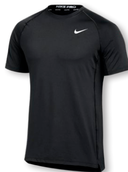
NIKE PRO SLIM SS TRAINING TOP DH4798 Page 33