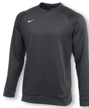
NIKE THERMA CREW CN9511 Page 15