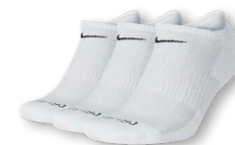
NIKE EVERYDAY PLUS CUSHION NO SHOW 3PPK SX6889 Page 46