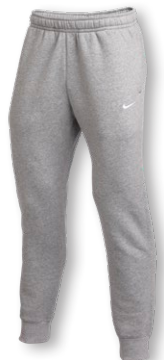
NIKE TEAM CLUB PANT CJ1616 Page 16