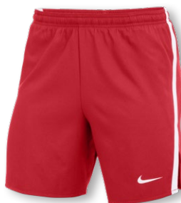
NIKE STOCK FAST 7IN SHORT CV2941 Page 43