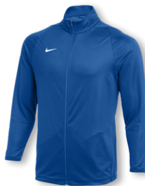
NIKE EPIC KNIT JACKET 2.0 CN9409 Page 13