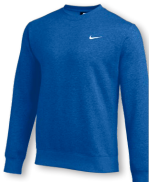
NIKE TEAM CLUB CREW CJ1614 Page 16