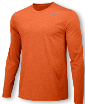
NIKE TEAM LEGEND LS CREW DV7298 Page 23