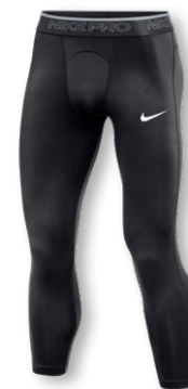
NIKE PRO 3/4 TRAINING TIGHT DH4780 Page 38