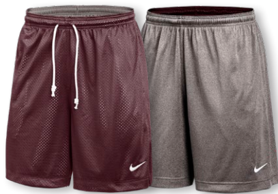
NIKE STOCK STANDARD ISSUE REVERSIBLE SHORT DZ4688 Page 40