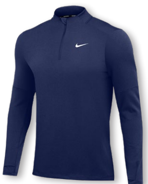
NIKE DRI-FIT ELEMENT 1/2-ZIP TOP DH4949 Page 18