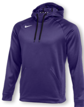
NIKE THERMA PULLOVER HOODIE CN9473 Page 12