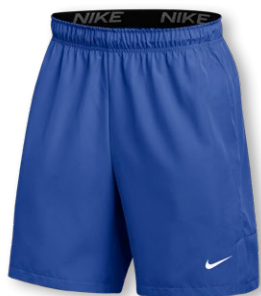
NEW NIKE TEAM DF FLEX WOVEN SHORT 7" NO POCKETS FQ3687 Page 42