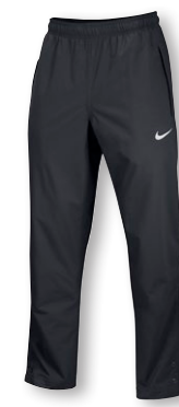
NIKE WATERPROOF PANT DA4984 Page 30