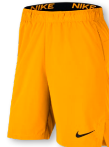
NIKE TEAM DF FLEX WOVEN SHORT DJ8686 Page 41