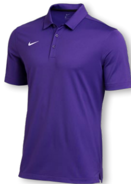
NIKE DRI-FIT FRANCHISE POLO CI4470 Page 27