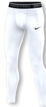
NIKE PRO TRAINING TIGHT DH4769 Page 37