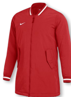
NIKE STOCK DUGOUT JACKET DC9103 Page 29