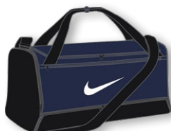
NIKE BRASILIA XSMALL DUFFEL 9.5 DM3977 Page 44