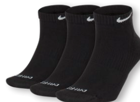
NIKE EVERYDAY PLUS CUSHION LOW 3PPK SX7040 Page 46