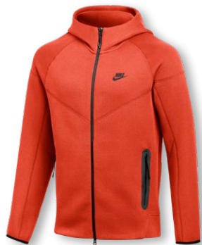
NEW NIKE TECH FLEECE FZ WINDRUNNER FQ1883 Page 9