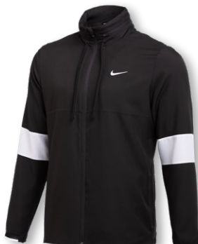
NIKE DRI-FIT JACKET CV0094 Page 10