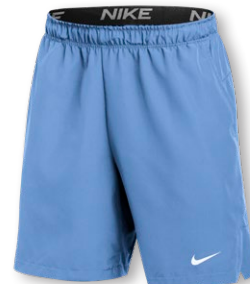
NEW NIKE DF FLEX WOVEN SHORT 7" FQ1885 Page 41