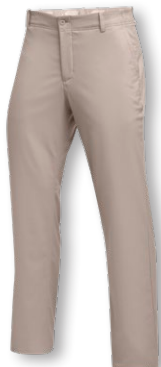
NIKE TEAM FLEX PANT CU9429 Page 39