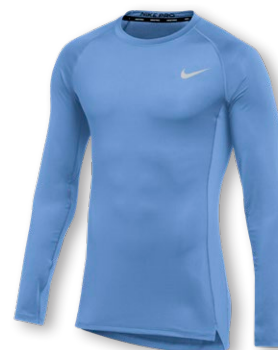
NIKE PRO TIGHT LS TRAINING TOP DH4791 Page 34