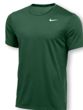
NIKE TEAM HYPER DF SHORT SLEEVE TOP CU9468 Page 20