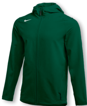
NIKE STOCK THERMA LS PRE-GAME FZ HOODIE CT2693 Page 14