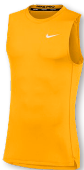
NIKE PRO SLEEVELESS TRAINING TOP DH4796 Page 35