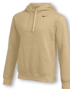
NIKE TEAM CLUB PULLOVER HOODIE CJ1611 Page 17