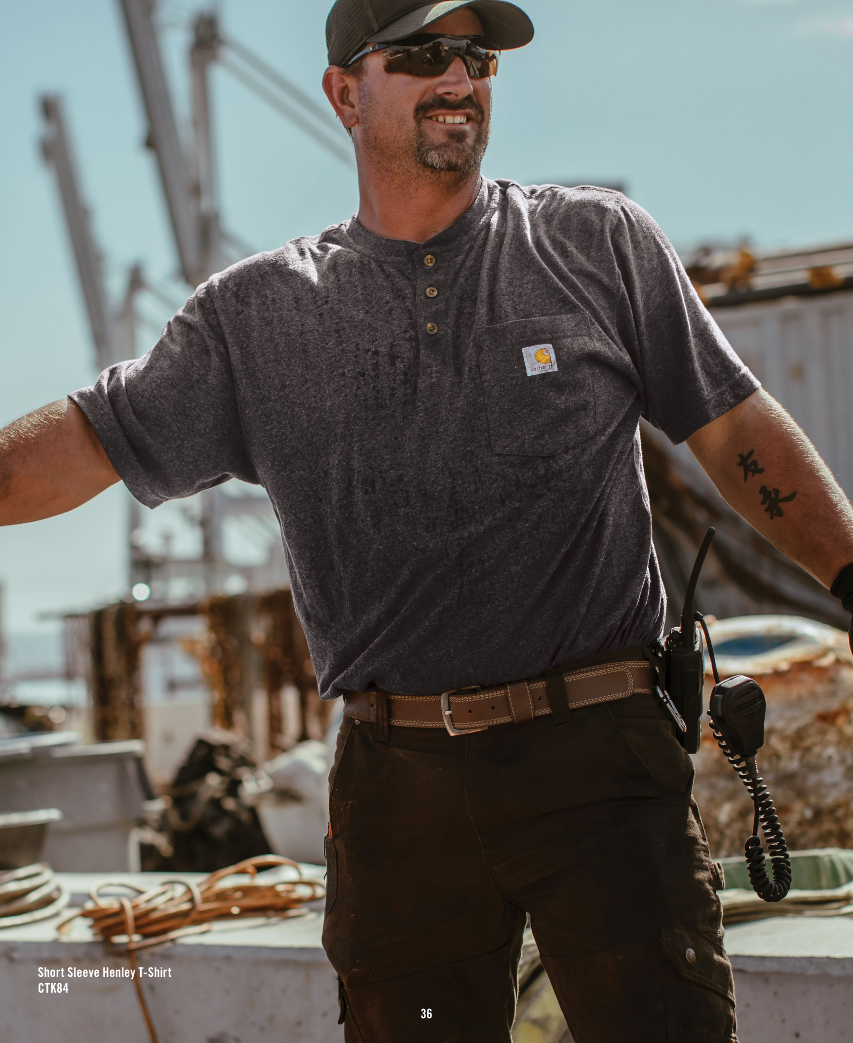
Short Sleeve Henley T-Shirt CTK84