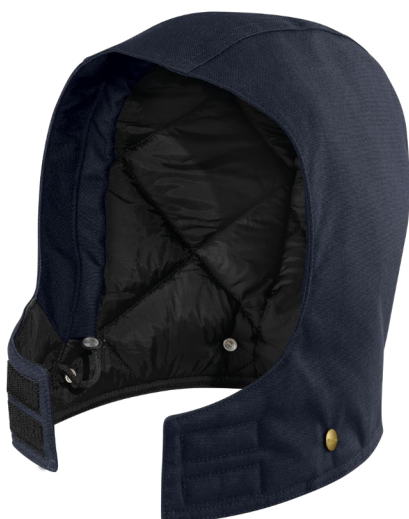
Firm Duck Hood CT102368