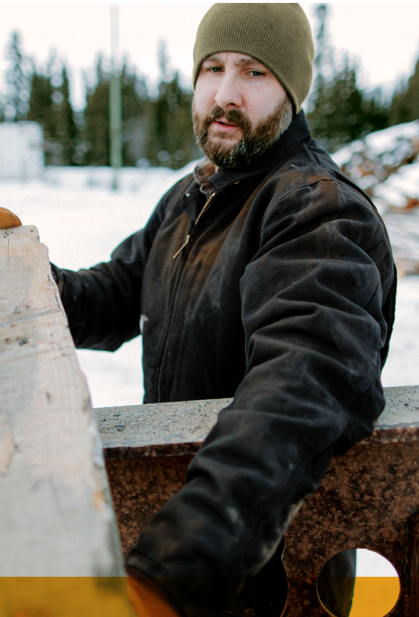
Sherpa-Lined Coats CT104293 | CTT104293 (Tall)