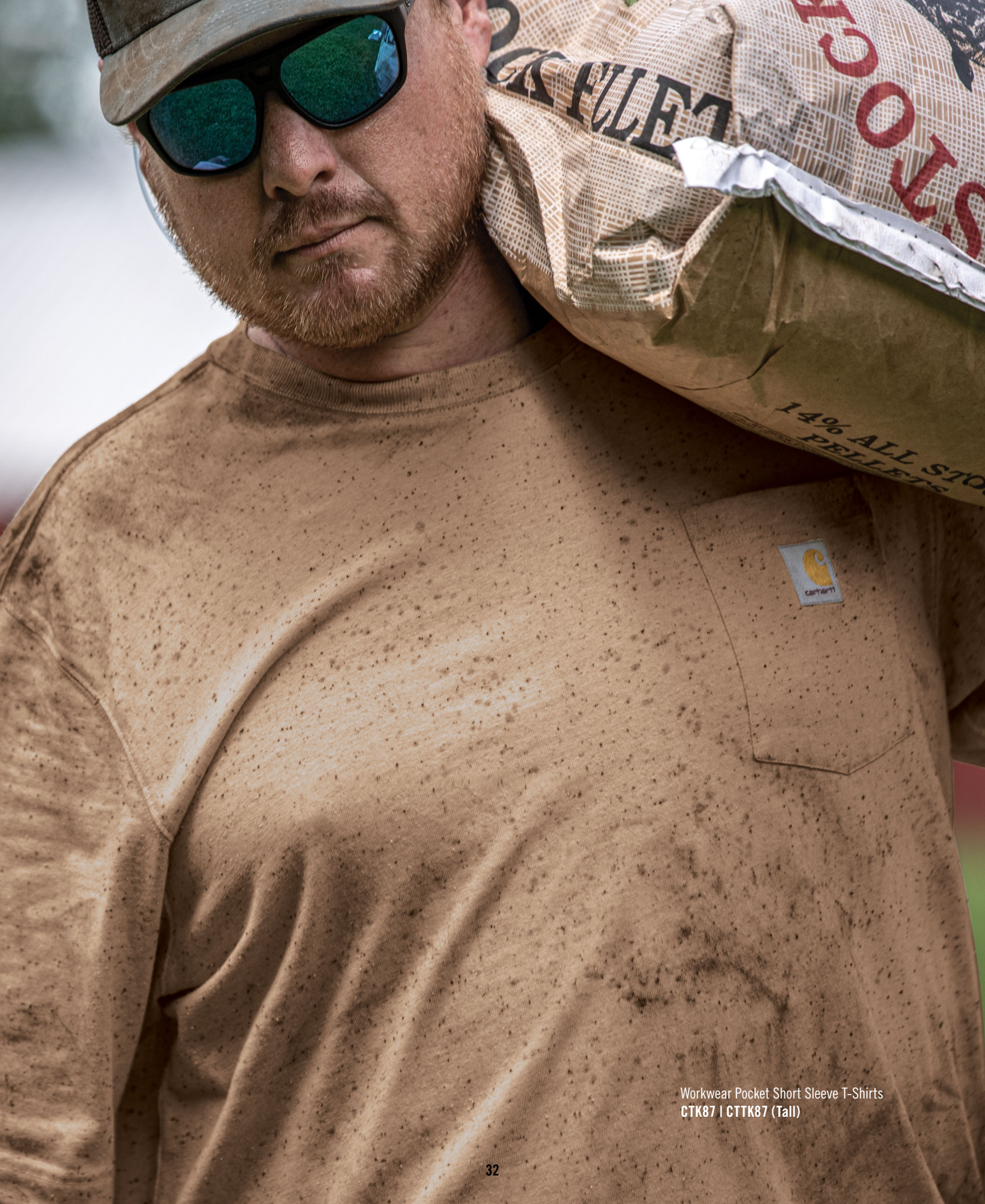
Workwear Pocket Short Sleeve T-Shirts CTK87 | CTTK87 (Tall)