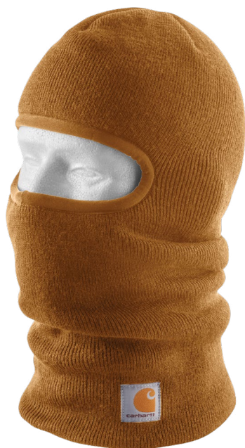
Knit Insulated Face Mask CT104485