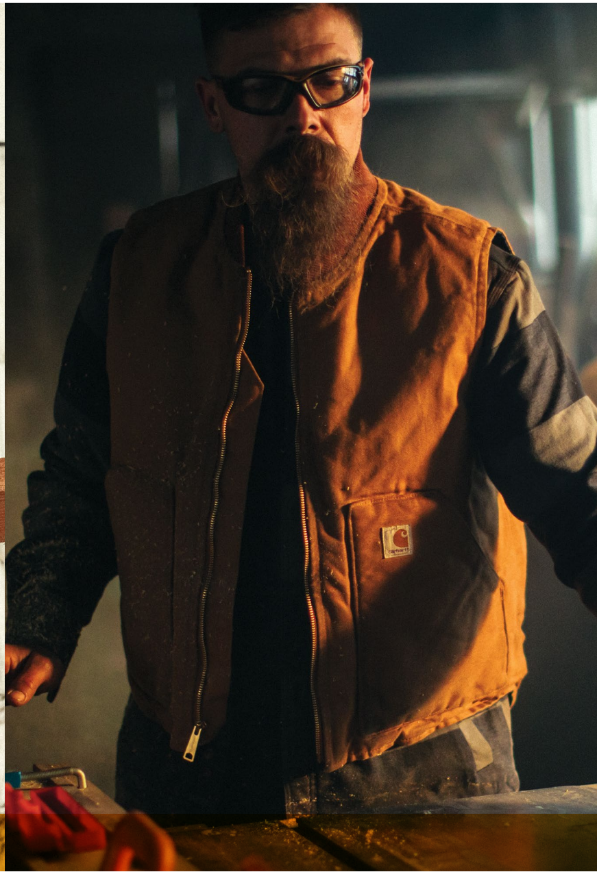
Duck Vest CTV01