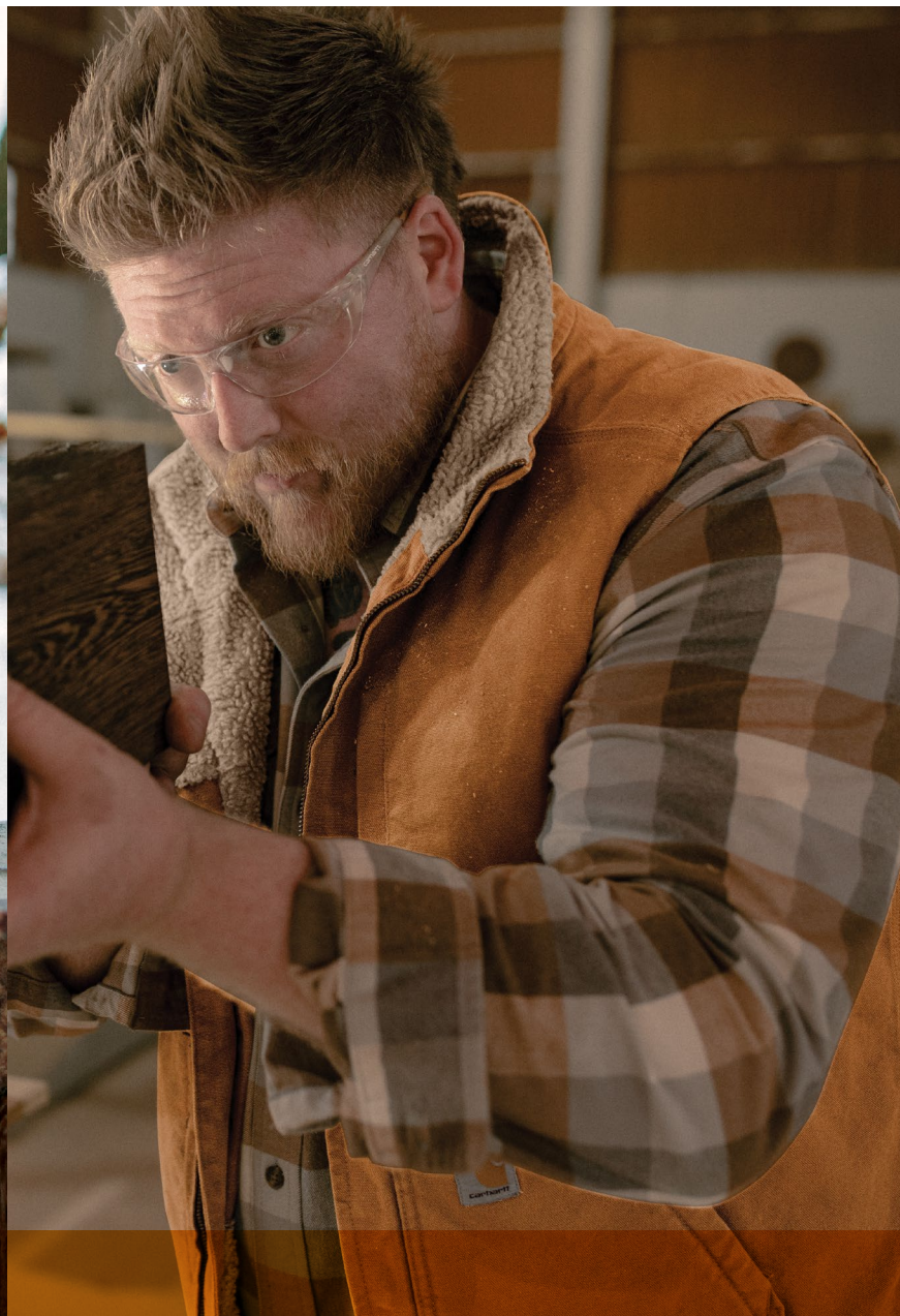
Sherpa-Lined Mock Neck Vest CT104277