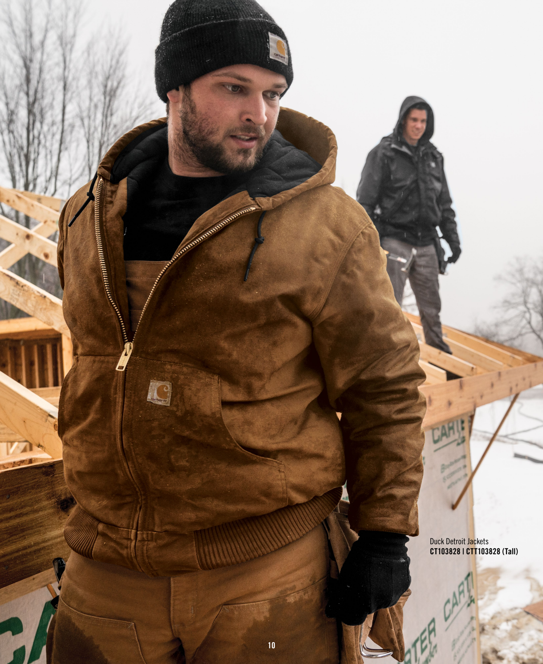
Duck Detroit Jackets CT103828 | CTT103828 (Tall)