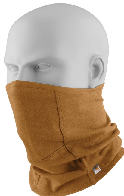
Cotton Blend Filter Pocket Gaiter CT105086