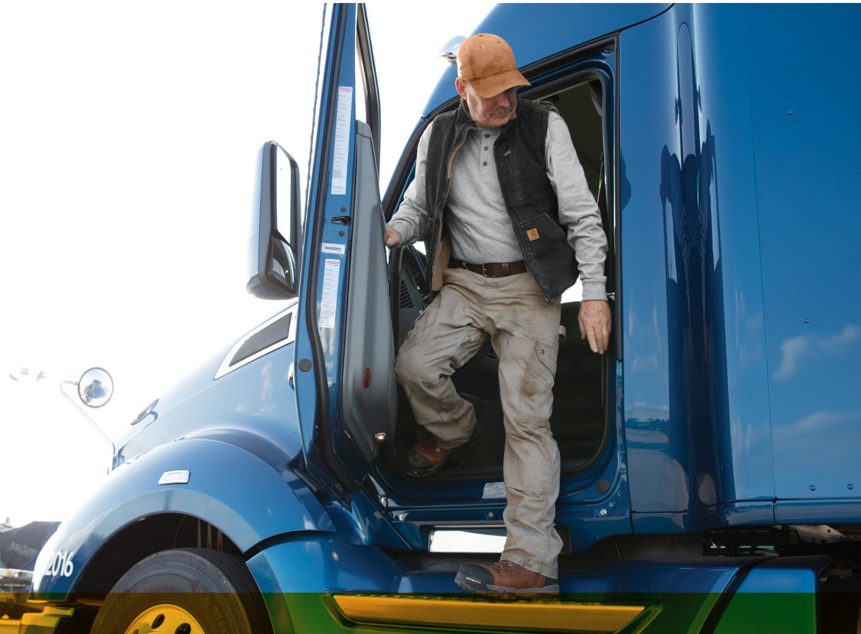
Long Sleeve Henley T-Shirt CTK128