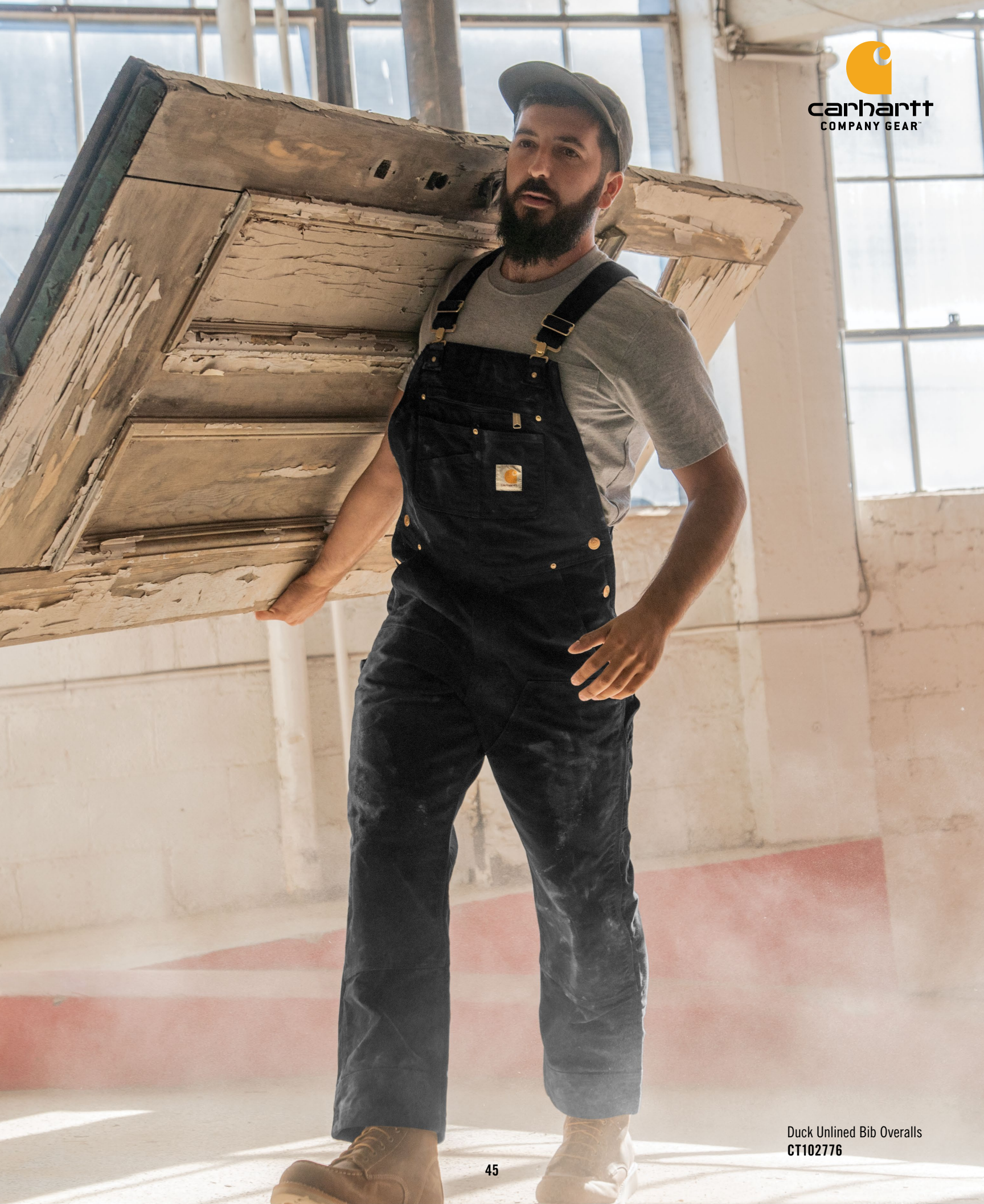
Duck Unlined Bib Overalls CT102776