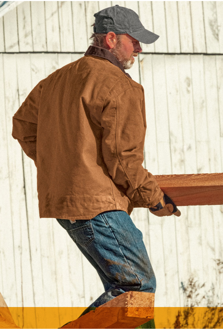
Duck Traditional Coats CTC003 | CTTC003 (Tall)