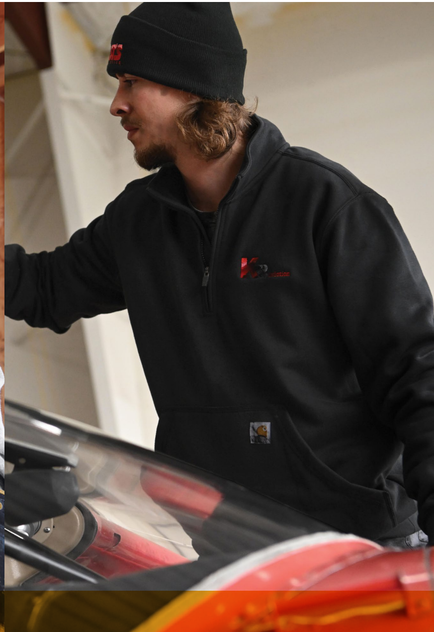
Midweight 1/4-Zip Mock Neck Sweatshirt CT105294