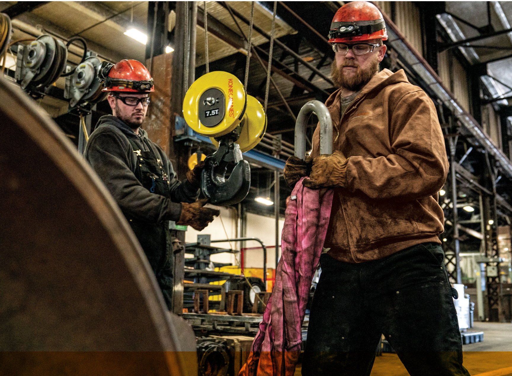
Thermal-Lined Duck Active Jacks CTJ131 | CTTJ131 (Tall)