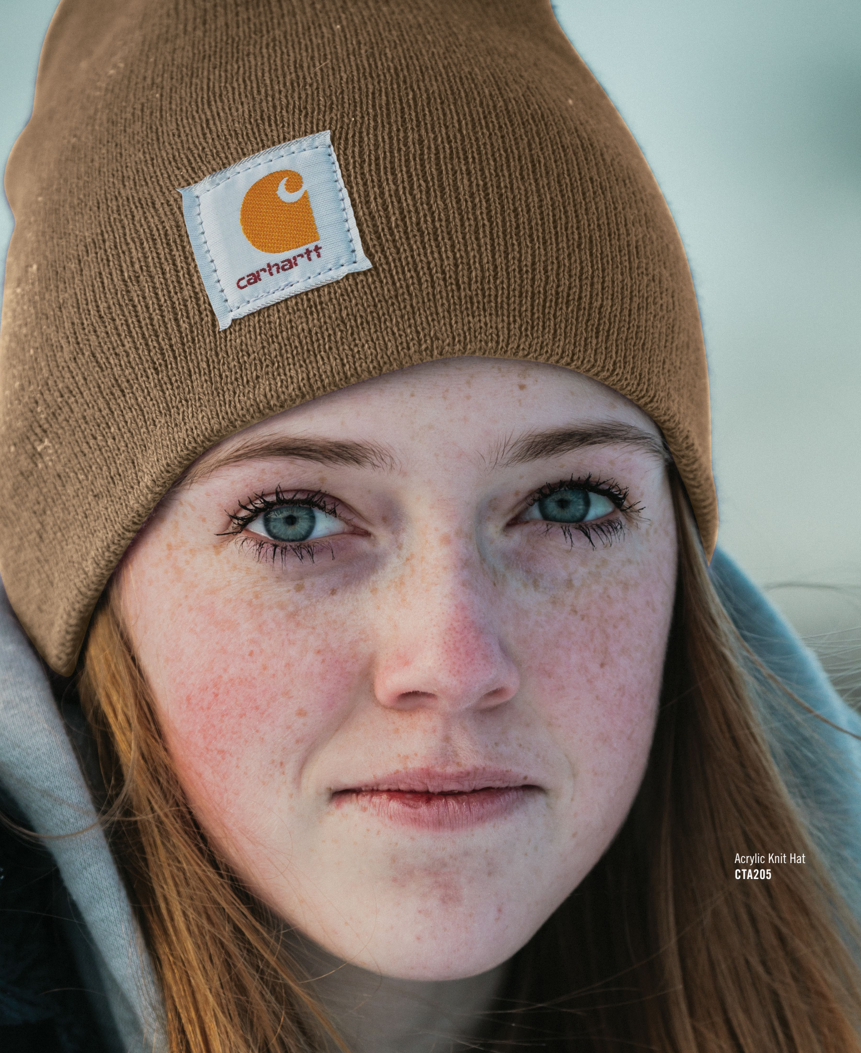
Acrylic Knit Hat CTA205